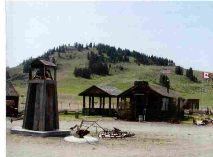
Old Molson, Ghost Town Museum