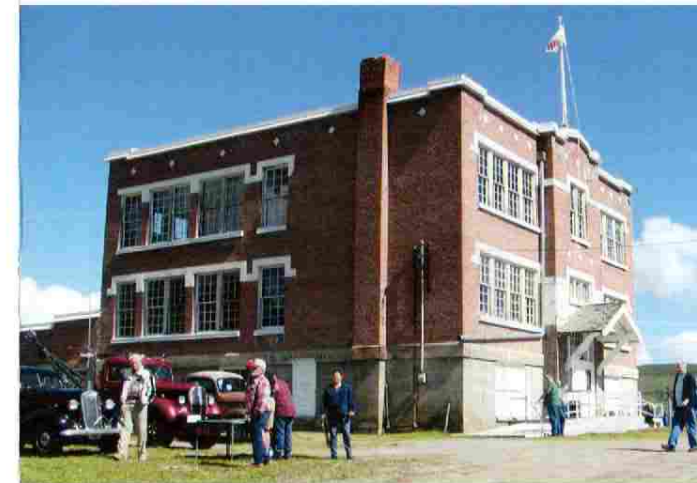
Molson Schoolhouse Museum