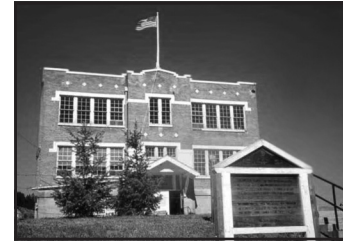
Old Molson Schoolhouse Museum