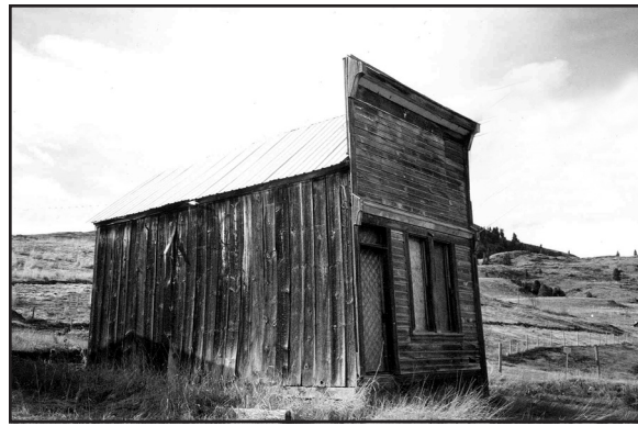
Early Customs Building in Chesaw, WA