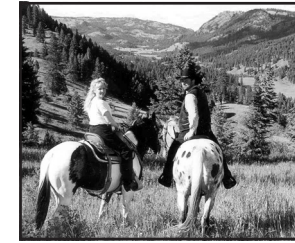
K Diamond K Guest Ranch