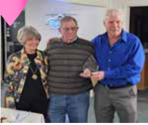
CITIZENS OF THE YEAR!